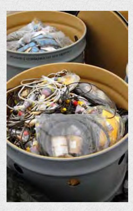
Recycling to prevent waste

Twenty-four tons of leadcontaminated waste and 1,440 tons of clay were reused when Pantex cleaned up lead at its outdoor firing range where security officers train. Cost savings from the reuse equaled more than $400,000 in shipping and disposal. Related work at the indoor range included changing over to non-lead ammunition to reduce 2,400 pounds of waste bullet fragments as well as dust generated when bullets hit the targets.