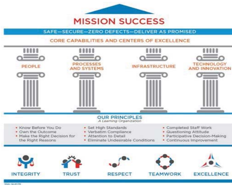
Figure 1- CNS Strategic Plan Model

CNS is committed to maintaining robust environmental, safety, and health (ES&H) programs, and has established safety as the first imperative of the corporation, as documented in the model (Figure 1) of the strategic plan.